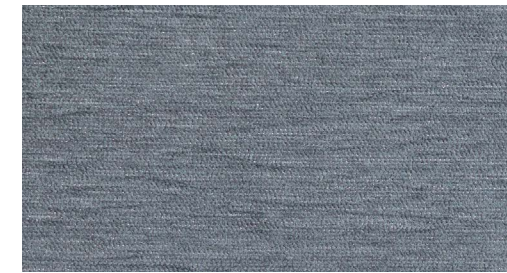
Medium Gray 27.3 yd 7F6-25-607 6.5 yd 7F6-6-607