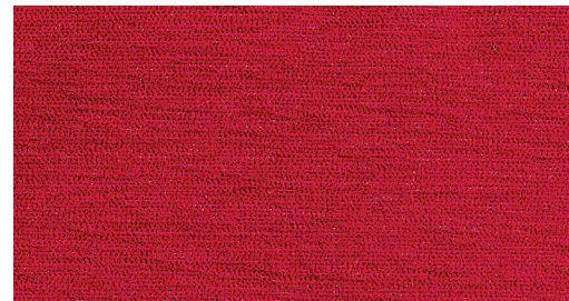
Red 27.3 yd 7F6-25-600 6.5 yd 7F6-6-600