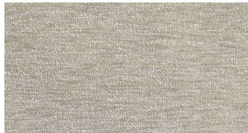
Beige 27.3 yd 7F6-25-604 6.5 yd 7F6-6-604