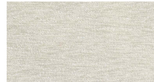
Cream 27.3 yd 7F6-25-605 6.5 yd 7F3-6-605