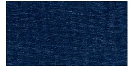
Navy Blue 27.3 yd 7F6-25-611 8.7 yd 7F6-6-611

Custom length rolls between 6.5 yards and 27.3 yards are available on request with extended lead time and cutting fee. Please contact your local representative for information.