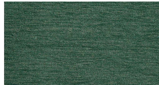
Forest Green 27.3 yd 7F6-25-608 6.5 yd 7F6-6-608