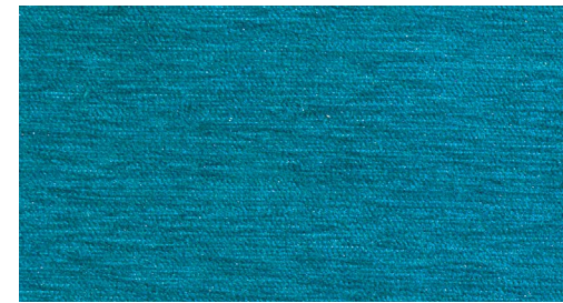
Teal 27.3 yd 7F6-25-603 6.5 yd 7F6-6-603