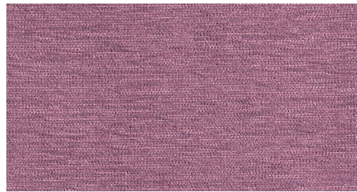
Powder Pink 27.3 yd 7F6-25-606 6.5 yd 7F6-6-606