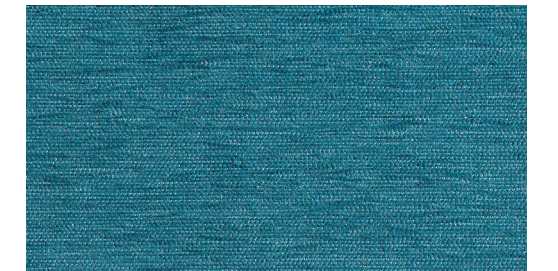
Powder Blue 27.3 yd 7F6-25-609 6.5 yd 7F6-6-609