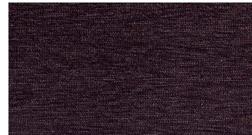
Coffee Brown 27.3 yd 7F6-25-601 6.5 yd 7F6-6-601