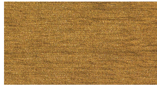
Mustard Gold 27.3 yd 7F6-25-610 6.5 yd 7F6-6-610